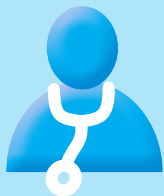
Health Care Providers

Make sure that transportation training programs offered at school or via VESID programs include instruction in the use of Medicaid funded transportation for health care visits.